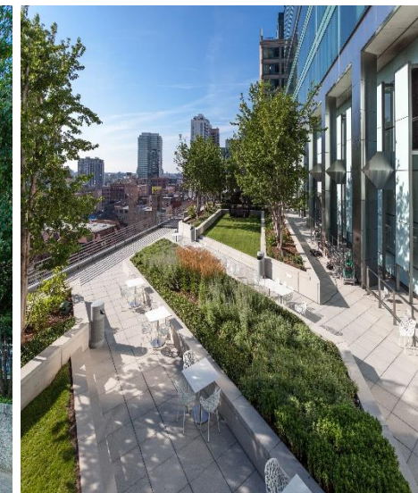
6 th Floor Roof Garden